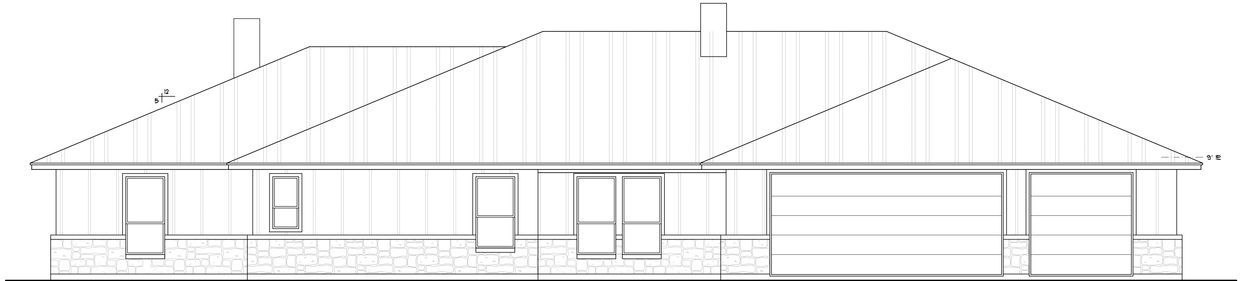
A FRONT ELEVATION SCALE: 1/4" = 1'-0"