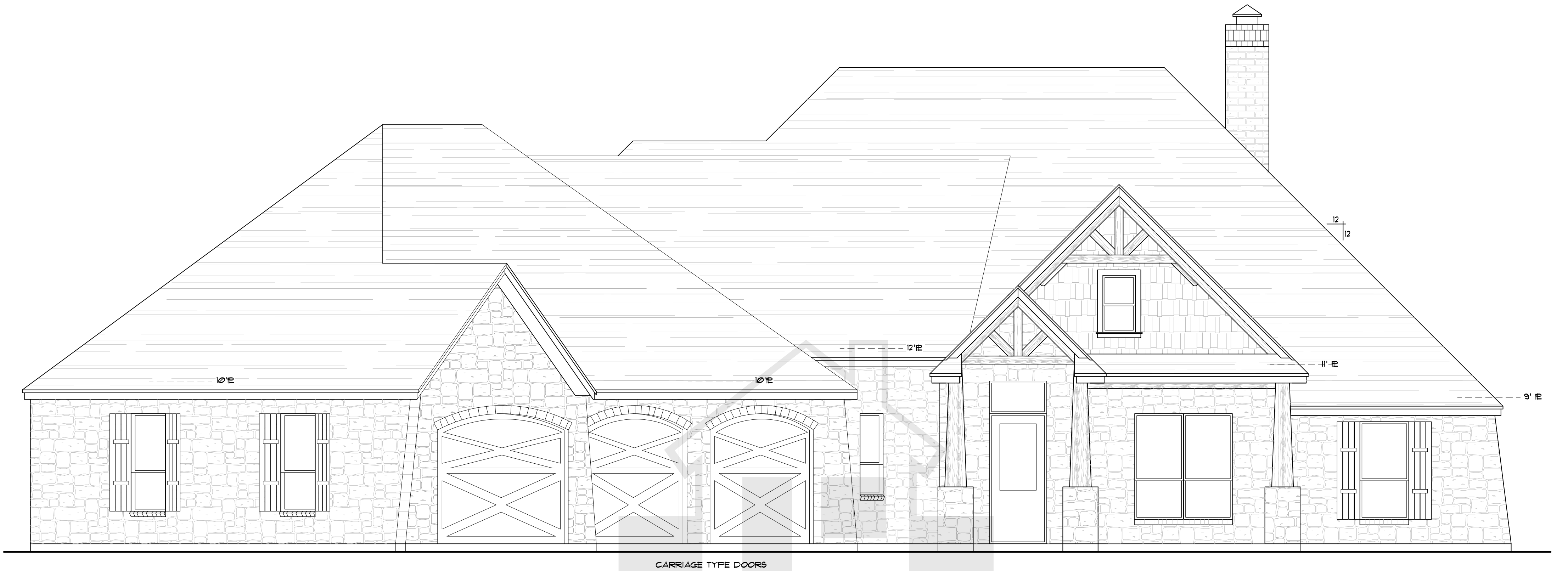
CARRIAGE TYPE DOORS